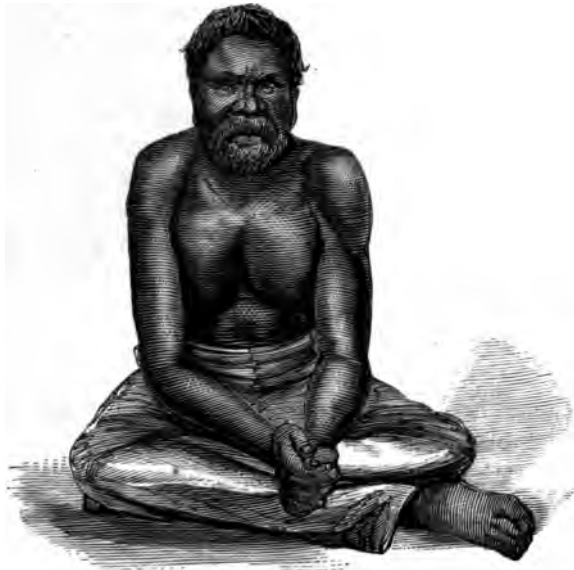
A FORTUNATE COOLIE DRESSED IN DIGGER'S TROUSERS.

At the commencement of the gold-diggings, the